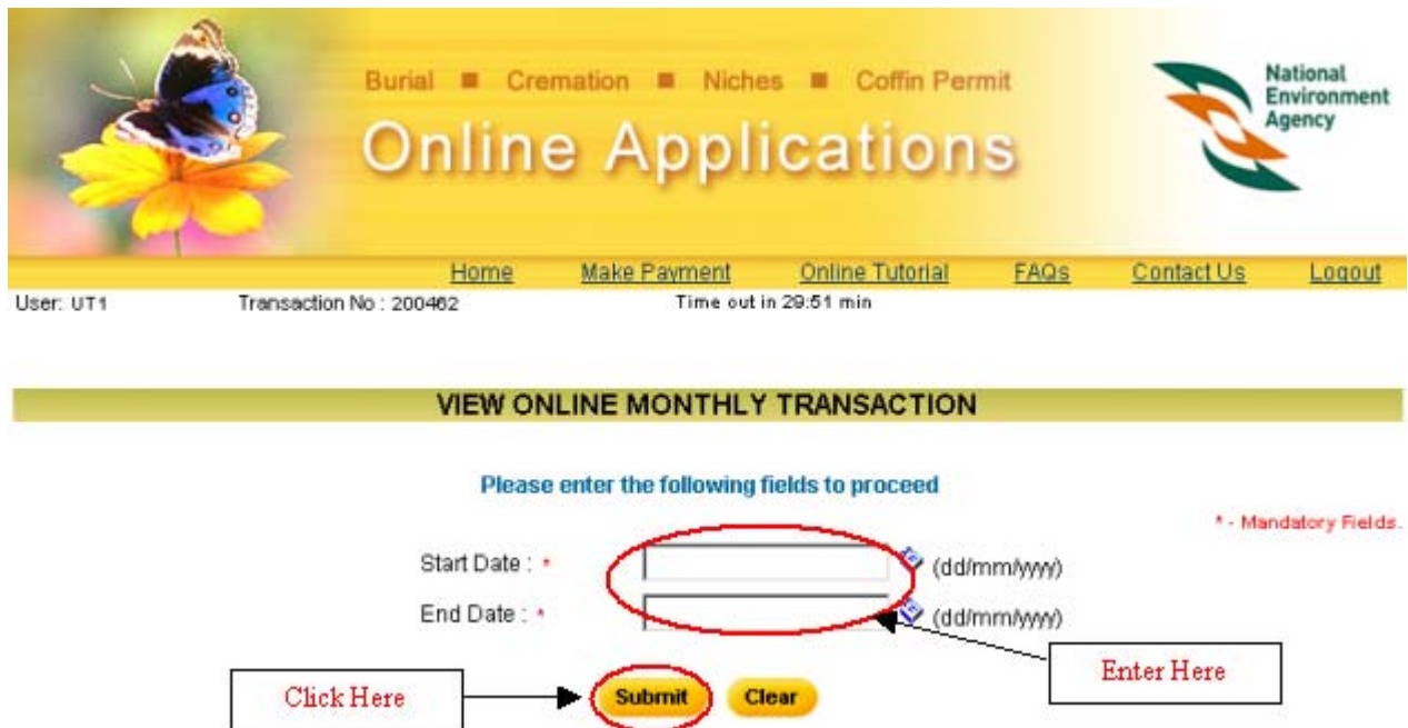
Diagram 2. View Online Monthly Transaction Page

Fill in the details in the enquiry page as shown in Diagram 2. Fields marked with asterisk (*) are mandatory.