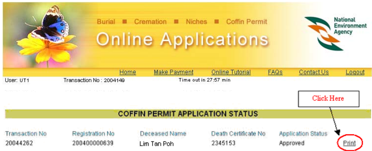
Diagram 4. The Result Page Of Coffin Permit Application Status Enquiry

Click " Print " to print the coffin permit. Refer to Diagram 4.