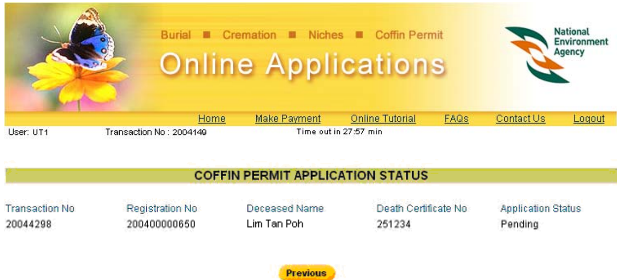
Diagram 3. The Result Page Of Coffin Permit Application Status Enquiry

If record is found, the Result Page Of Coffin Permit Application Status Enquiry will be displayed (refer to Diagram 3). If Application Status is Approved, " Print " hyperlink will be available to print the permit. (refer to Diagram 4)